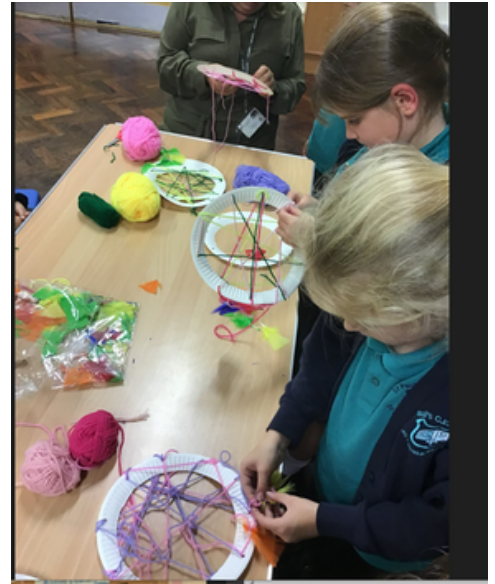
The children in SPLASH enjoyed making 'dream catchers at the end of term.