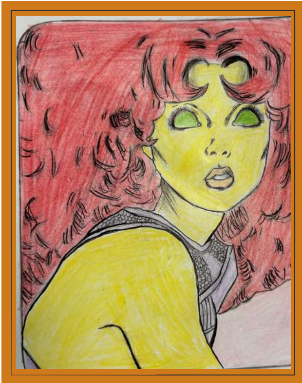
ANTONIA (YEAR 6)