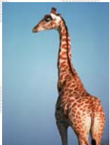
The neck of a giraffe?

Think about these animals and their special attributes and why they are important to the animal and how it lives.