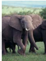
The trunk of an elephant?