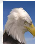
The eyes of an eagle?