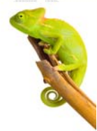
The skin of a chameleon?