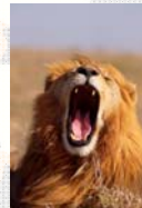
The mouth of a lion?