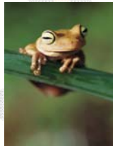
The pads of a frog?