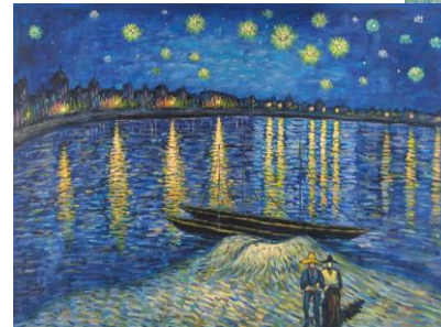
Van Gogh Impressionists